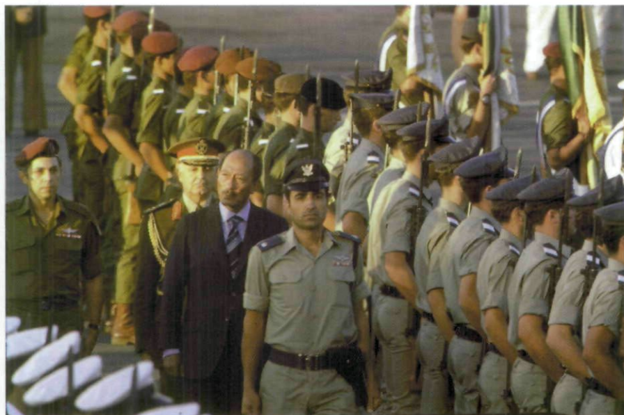
Above: President Sadat inspecting an Israeli guard of honour at Ben Gurion airport on his way back to Cairo after addressing the Israeli parliament in Jerusalem, November 1977.

the October 22nd lines and the implementation of Resolution 338. This time the ceasefire held and the war was finally brought to a close. The associated oil embargo on the US was lifted in March 1974. Kissinger moved to centre stage to kick-start a peace process. At a news conference the morning after the alert, he presented his position: 'The conditions that produced the war were clearly intolerable to the Arab nations, and ... in a process of negotiations it will be necessary to make substantial concessions.' The following day he convinced Israel to permit the resupply of the Third Army, thereby preventing a decisive victory for Israel and delivering the military stalemate for which he had worked throughout the war. A grateful Sadat took due note.