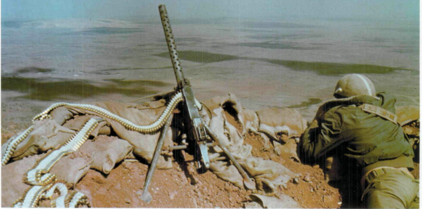
An Israeli soldier on watch over Syria from the Golan Heights in late October.

the early hours of October 9th the Israeli ambassador, acting on Meir's instructions, pressed Kissinger for significant arms supplies as Israel desperately needed to replenish its arsenal. Kissinger consulted Secretary of Defense James Schlesinger, who warned a major rearmament of Israel was liable to provoke an Arab oil boycott. As a result, no firm decision was taken. With Nixon mired in the Watergate scandal, Meir was aware that Kissinger was calling the shots. She sought to circumvent him, contacting Nixon directly and reminding him that she had vetoed a pre-emptive air strike that would have saved many Israeli lives.