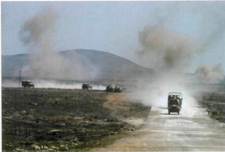
Above: an Israeli convoy under attack as it advances into Syria.

nies in favour of the producing nations, thus giving Sadat's strategy a realistic chance of success.