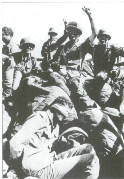
Below: an Egyptian prisoner of war and triumphant Israeli soldiers after establishing a bridgehead on the west side of the Suez Canal.

tions with Moscow and the survival of Israel, not the rising cost of oil.