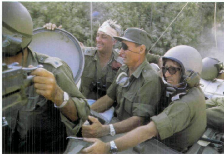
Above: Israeli tanks cross the Suez Canal, watched by General Moshe Dayan, left.