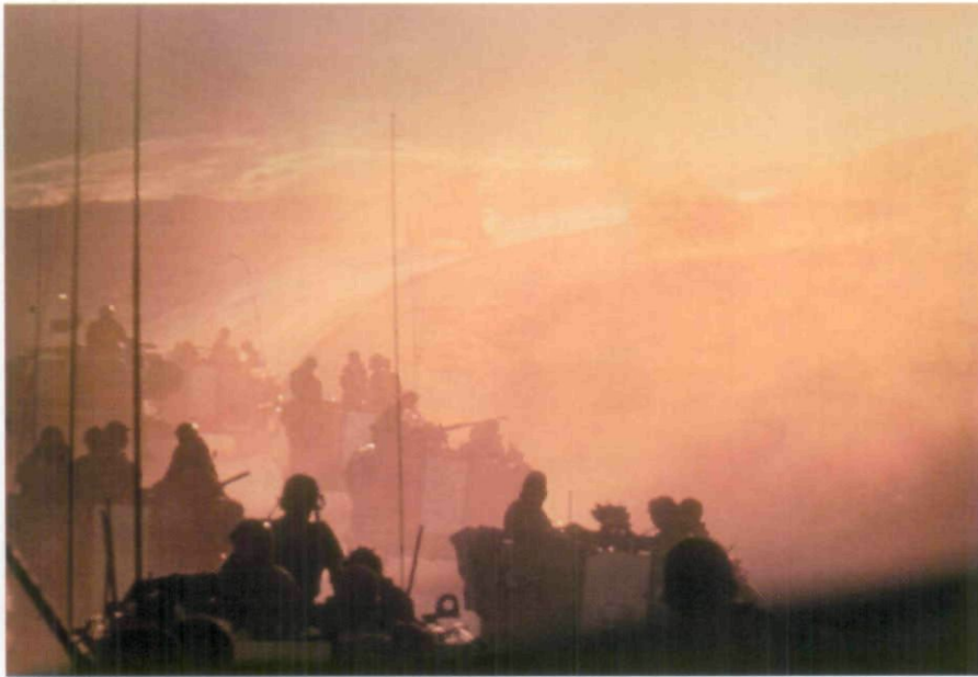
Above: Israel's counter-attack: armoured personnel carriers in the Sinai Desert rolling back the over-extended Egyptian army.

gambling instead that war would only come once Egypt acquired the offensive capability provided by fighter-bombers.