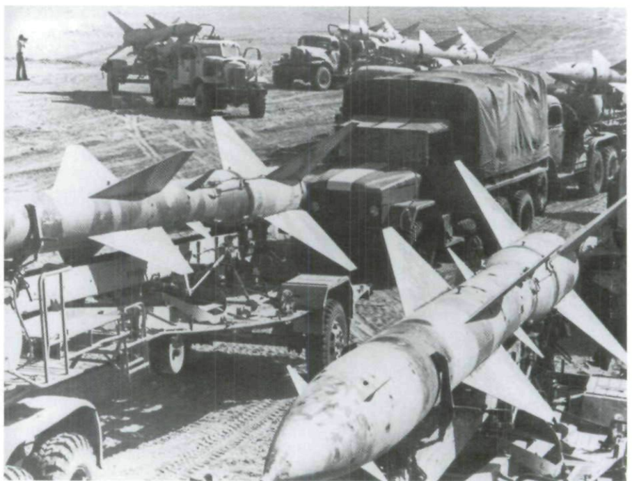
Below: Egyptian Soviet-made anti-aircraft missiles captured on the west bank of the Canal awaiting transport to Israel after the cease-fire.